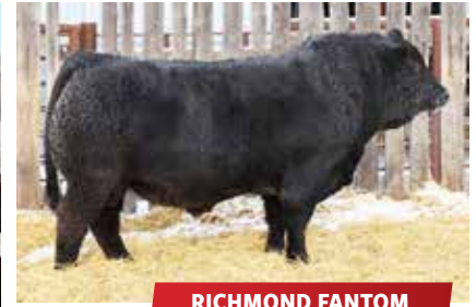
RICHMOND FANTOM SIRE OF LOT 43