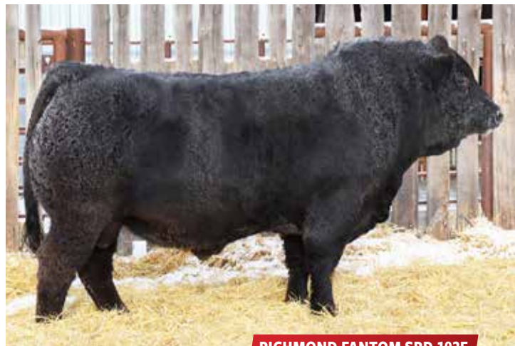
RICHMOND FANTOM SRD 102F SIRE OF LOTS 34 - 35

These flush calves are off 2 different sire groups, but both are similar in type being long-spined, deep-bodied, muscular animals while maintaining excellent structure, feet, hair, and temperament. In today's market where pounds matter on sale day these brothers will add to the paycheck on sale day while also adding great females to your replacement pen.