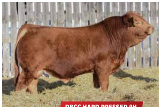
DBCC HARD PRESSED 9H SIRE OF LOT 33