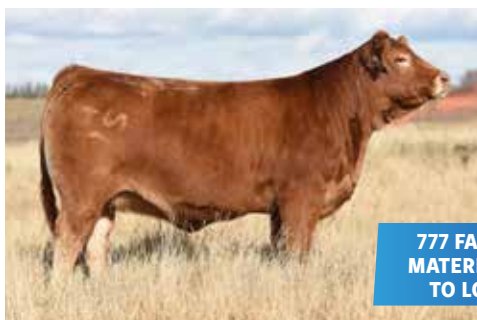
777 FANTASY MATERNAL SIB TO LOT 31