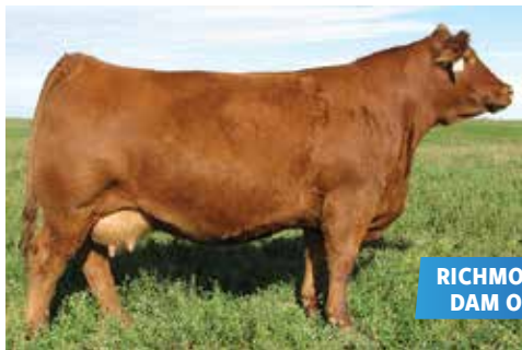
RICHMOND XOTIC DAM OF LOT 30

Something a little different in Lot 30 and 31. We had a bull go down unnoticed leaving a good group of cows open so we decided, let's try some October/November calving on some ET calves. This is how these boys were created. Lot 30 is a dark red homo polled bull with big scrotal and off some very influential parentage. Richmond Xotic SRD 6X was a great donor cow for Richmonds with lots of high end progeny. RPY Paynes Diesel 37D continues to show his quality in calves every year across North America.