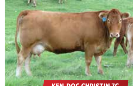
KEN-DOC CHRISTIN 7C DAM OF LOT 43