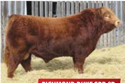
RICHMOND DUKE SRD 8D SIRE OF LOT 44