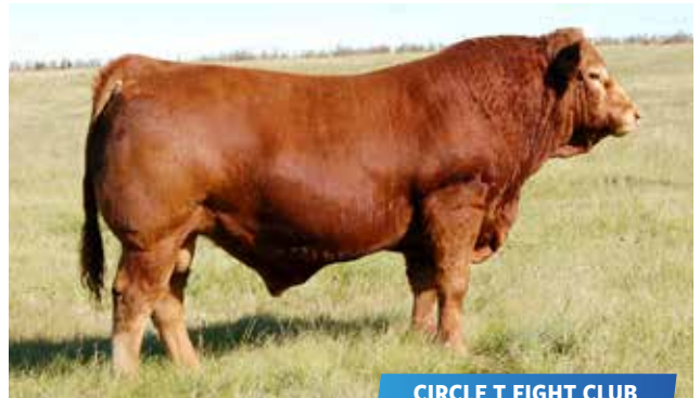
CIRCLE T FIGHT CLUB SIRE OF LOT 32