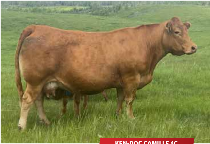
KEN-DOC CAMILLE 4C DAM OF LOTS 34 - 37