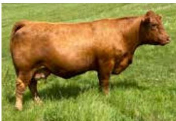
KEN-DOC BECKIE 18B - DAM OF LOT 33