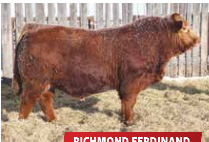
RICHMOND FERDINAND SIRE OF LOTS 38 - 40