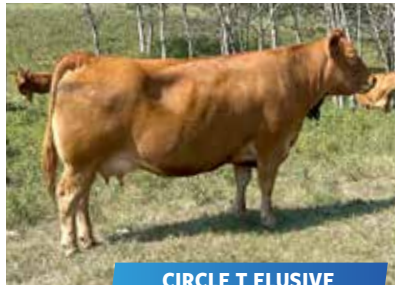
CIRCLE T ELUSIVE DAM OF LOT 32