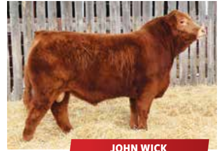
JOHN WICK FULL BROTHER TO LOT 38