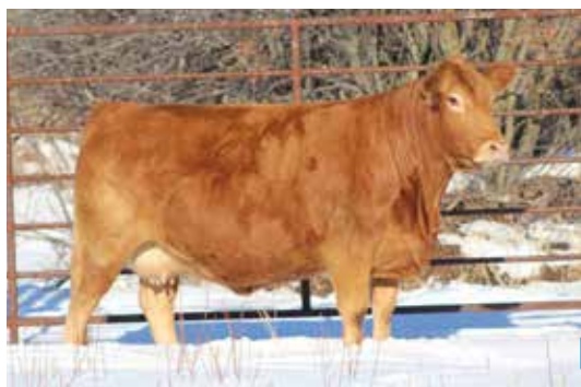
SIRLOIN EXOTIC - DAM OF LOT 18