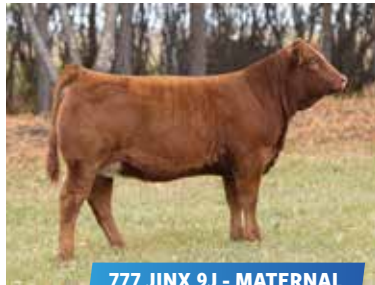
777 JINX 9J - MATERNAL SIB TO LOT 32