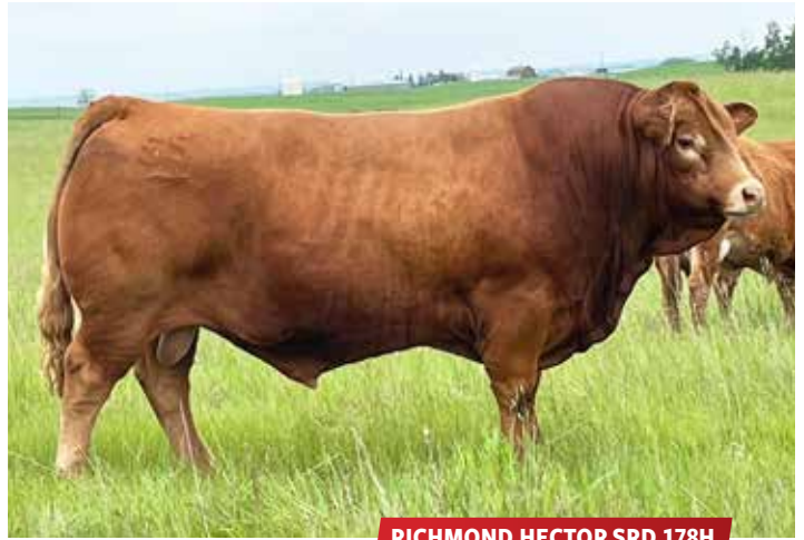
RICHMOND HECTOR SRD 178H SIRE OF LOTS 36 - 37